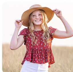
Elsa Groenink Secchia Institute for Culinary Education GRCC