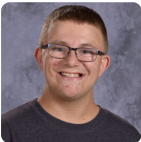
Alec Snip High School Class of 2023