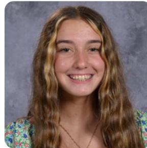
Madelyn O'Gorman High School Class of 2025