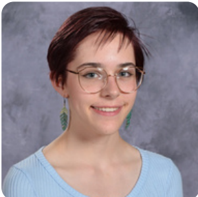
Willow Davidson High School Class of 2025